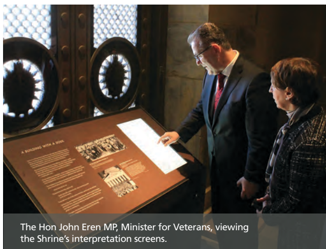
The Hon John Eren MP, Minister for Veterans, viewing the Shrine's interpretation screens.

Throughout 2017 the VVC conducted three roundtable consultations on issues affecting the veterans sector in Victoria and to discuss collaboration. The VVC facilitated these Roundtables at the request of the Minister for Veterans, in response to recommendations in the Veterans Sector Study Report 2015 . At the final Roundtable consultation on 9 November, the participants agreed to establish the Victorian Veteran Sector Collaborative Committee. The Committee met twice in 2017-18.